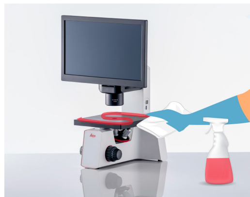
Figure 3. Cleaning Mateo TL stage in an "S" shaped pattern.

Extensively moisten (soaked, but not dripping wet) a new soft tissue in ethanol 70% Slowly wipe the microscope stage in an "S"-shaped pattern, but do not go over the same area twice (Figure 3).