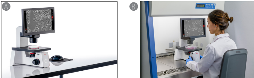
Figure 1: Operation of Mateo TL on a bench (A) or in the cell culture laminar flow hood (B).

Whether using Mateo TL on a bench or inside a laminar flow hood (Figure 1), regular cleaning of the microscope is recommended. To protect yourself and your work, the use of disposable gloves for microscope operation and cleaning is highly recommended.