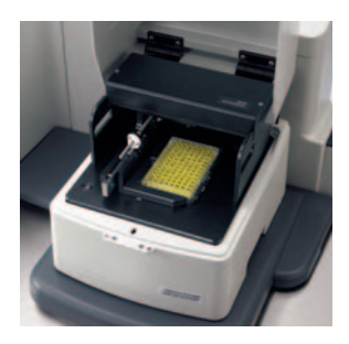
The Well-Plate Autosampler toolhead for the UPS accessory. Customized tablet holders are available for automated multi-tablet sampling.

Japan +81 45 453 9100 Latin America +1 608 276 5659 Middle East +43 1 333 5034 127