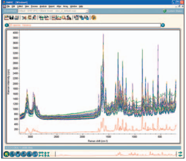
Figure 2: Spectra collected from 25 points on the surface of a scraped painkiller tablet with the VDPS turned off (excitation laser spot size approximately 10 \mu m). The spectrum in red is the variance between the 25 spectra. Spectra collected using 780-nm high-brightness laser and full-range grating on a DXR SmartRaman spectrometer equipped with a UPS accessory with a Well-Plate Autosampler.