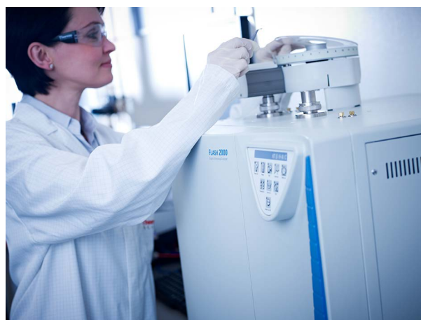
Figure 1. FLASH 2000 CHNS/O Analyzer.

by pyrolysis in a consequent run. From the CHNS/O data obtained, the dedicated Thermo Scientific™ Eager Xperience Data Handling Software calculates automatically the heat value GHV and NHV (Gross Heat Value and Net Heat Value, both expressed in kcal/kg) and the CO 2 emission trade data.