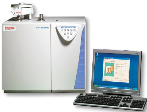
Thermo Scientific FLASH 2000 CHNS/O analyzer

The importance of compost testing has grown dramatically in recent years and many of the classical methods are now no longer suitable for routine analysis. Organic elemental analysis has always been a traditional method to characterize these materials and it is very important to have an accurate and precise technique which provides fast analysis with excellent reproducibility.