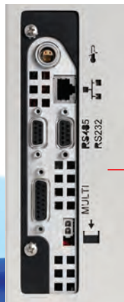
Comprehensive communications included. 1