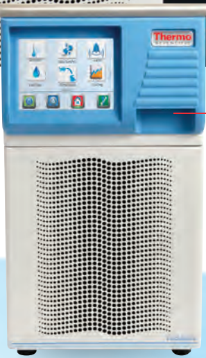
USB, MicroUSB, RS232 accessible from front of unit. 1