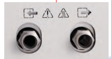
Hose barbs and threaded adapters included. 1