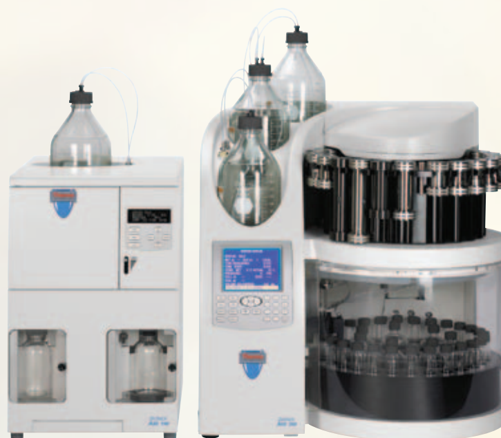
Dionex ASE 150