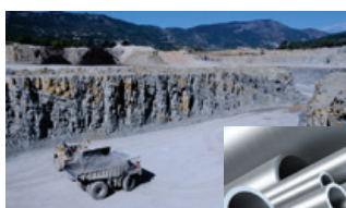
Geology, Cement, Mining